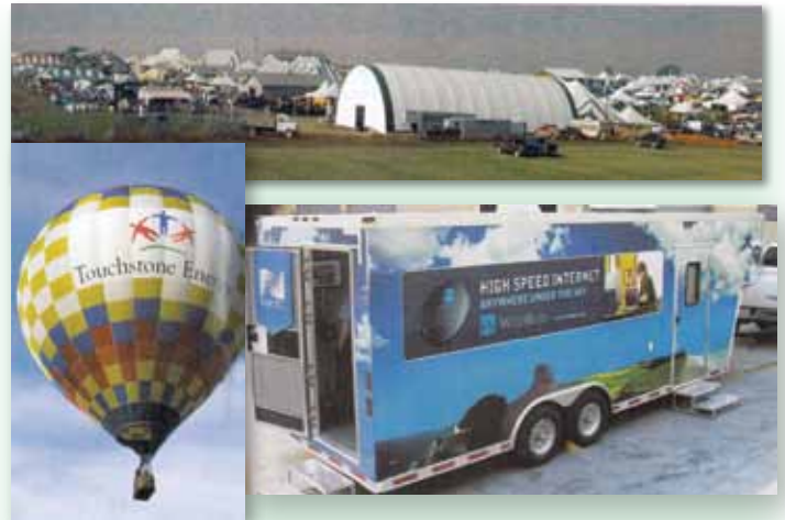
The Touchstone Energy balloon and "Speedy," the WildBlue Internet trailer, were on hand at the 2005 Farm Technology Days held at the Malm Rolling Acre farm.

As the host utility, Clark Electric Cooperative has