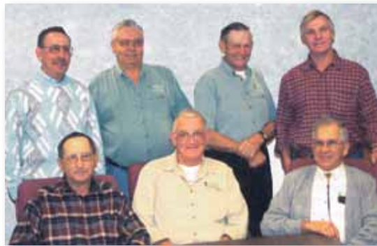
For the first time, all seven directors received the Credentialed Cooperative Director certificate at once in 2003.

Lastly, thank you to the members for your understanding when the lights were out, including the times when there were persistent problems and outages may have occurred more than once in a short period of time.